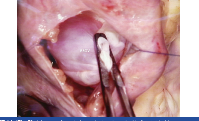
[Table/Fig-3]: Intraoperative photograph showing a ball in the right atrium

Cardiac catheterization study confirmed Rupture Sinus of Valsalva (RSOV) arising from right coronary sinus and projecting to right atrium with oxygen step-up in RA. Intraoperatively the enlarged, globular mass seen in RA [Table/Fig-3] was plicated and Poly Tetra Flouro Ethylene (PTFE) patch closure of aortic end of the sinus was performed.