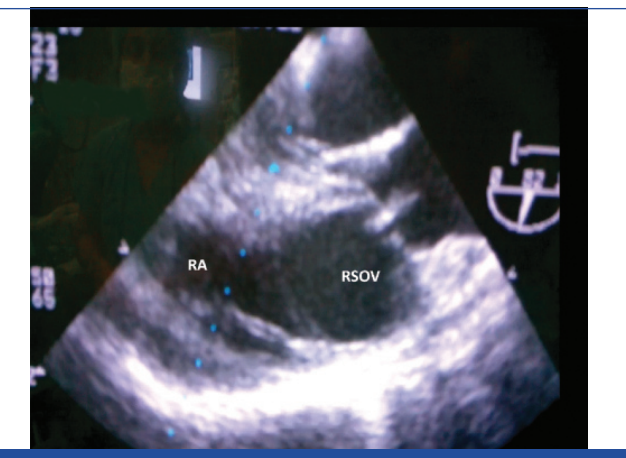
[Table/Fig-1]: Transesophageal Echocardiography (TEE) showing ball in RA. RA: Right atrium, RSOV: Ruptures sinus of valsalva

A 28-year-old female presented with dyspnea on exertion for the last three years. Clinical examination showed presence of systolic murmur over 2<sup>nd</sup> intercostal space radiating to ipsilateral axilla. Trans-Oesophageal Echocardiography (TTE) revealed enlarged Right Atrium (RA), Right Ventricle (RV) and Left Atrium (LA). TTE also showed presentation of a ball in the right atrial cavity [Table/Fig-1], along with normal bilateral ventricular function and left to right shunt [Table/Fig-2].